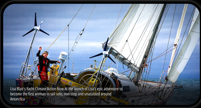
Lisa Blair's Yacht Climate Action Now At the launch of Lisa's epic adventure to become the first woman to sail solo, non-stop and unassisted around Antarctica

Exclusively available from Arcus Wire Group, the hamma® range of stainless steel wire rope and fittings represents our premium stainless steel offering, engineered for performance, reliability and long-term durability.