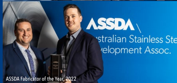
ASSDA Fabricator of the Year, 2022

FOR MORE INFORMATION 1800 ARCUSW 1800 272 879 SALES@ARCUSWIRE.COM